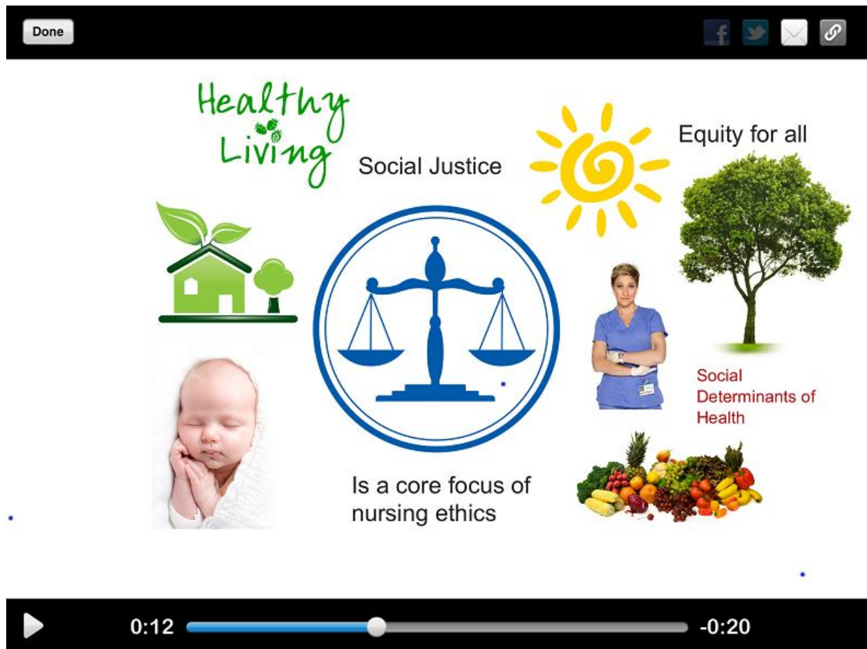
Figure 2: Screenshot of iPad Educreations App Viewing Screen